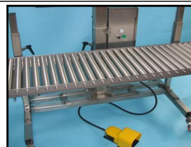
EXAMPLE Height adjustable gravity roller track system, integrally mounted, available in a range of lengths.

Bag Support Tray (see front image photo). Suitable for 25Kg bag /sack and is height adjustable. Gravity Roller Track, assists the operative in presenting a regular supply of heavy bags to the sealer. Motorised belt conveyor with stop/start operation via a foot switch. assists the operative in presenting a regular supply of heavy bags to the sealer.