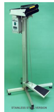
INSET STAINLESS VERSION